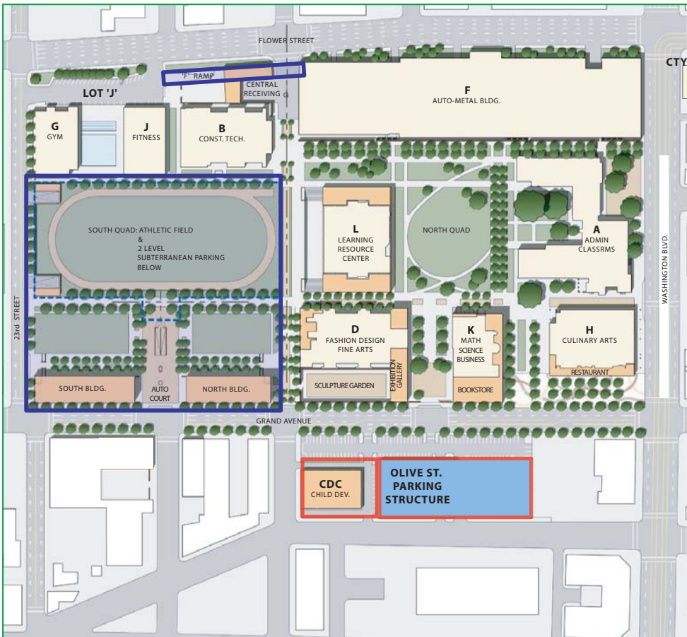
PROPOSED 5 YEAR CAMPUS PLAN